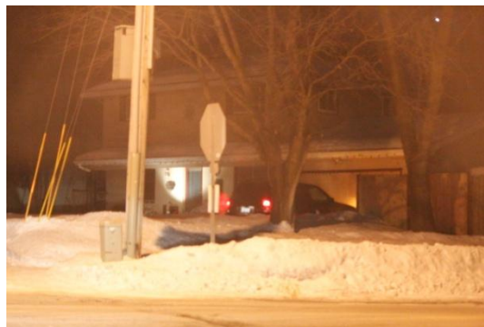
06:01 am February 10, 2014

06:01 am The agent obtained the first descriptive film of the area, (photo) and noted no visible sign of activity. The agent did observe an interior light on in the SE corner of the residence. Also observed was the Ford Escape in the driveway was running, with the parking lights on.